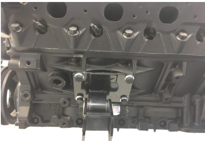
EM85HP - PASSENGER SIDE