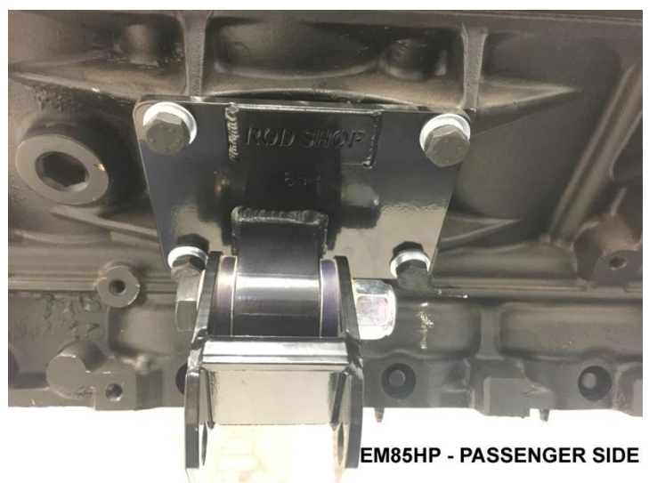
EM85HP - PASSENGER SIDE